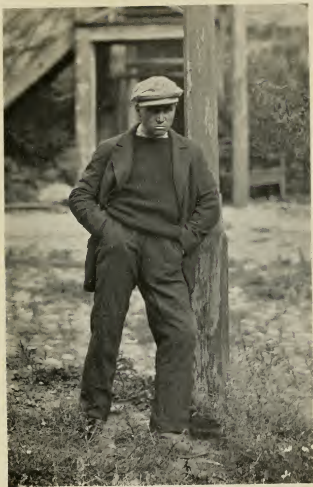
GUNTHER PLÜSCHOW IN THE DISGUISE OF A DOCK LABOURER IN WHICH HE ESCAPED