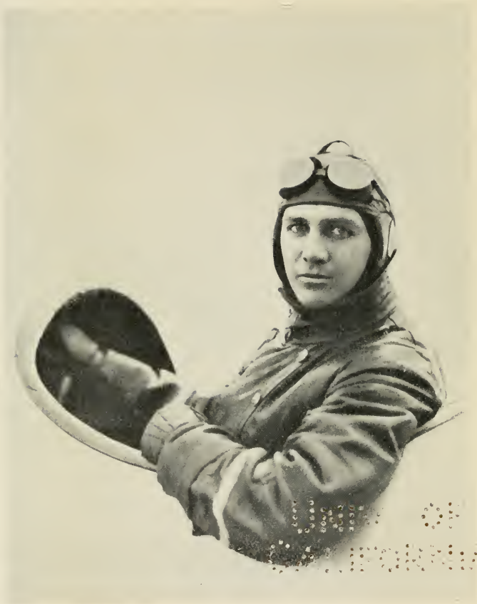
KAPITÄNLEUTNANT GUNTHER PLÜSCHOW